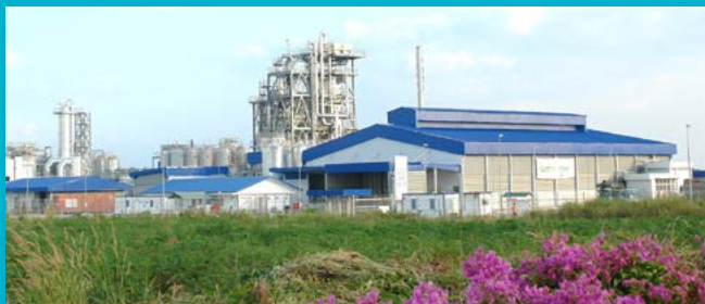
Corbion factory in Thailand

We also have structured emergency response plans, crisis management procedures and business continuity plans in place to ensure we can secure the highest business reliability possible. Corbion aims at creating resilient supply chains for its clients. To that purpose we have multiple production locations.