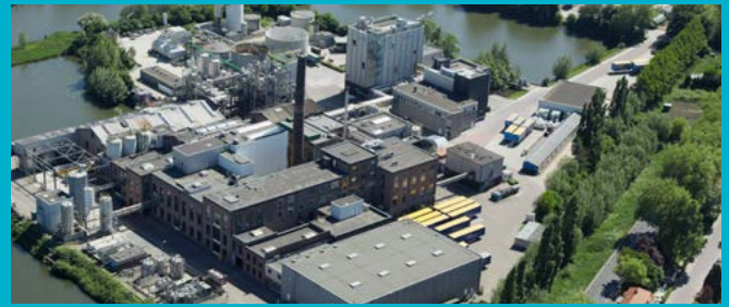
Corbion factory in The Netherlands

Corbion produces high quality lactic acid and derivatives using a biochemical fermentation process by efficient conversion of sugars. Corbion products are regarded as safe, offering a good alternative to traditional products that have become under increased regulatory pressure.